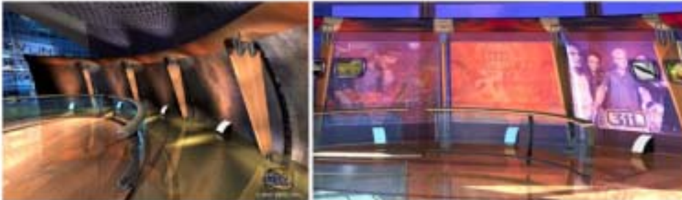
Softsets from DDG(Devlin Design Group)